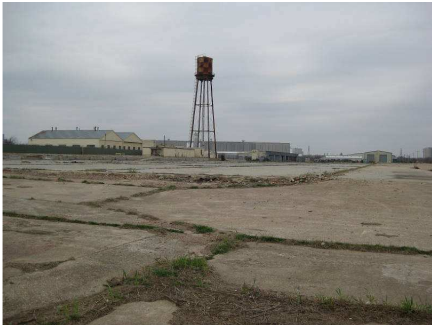
This is all that remains of the main building. Just the slab.