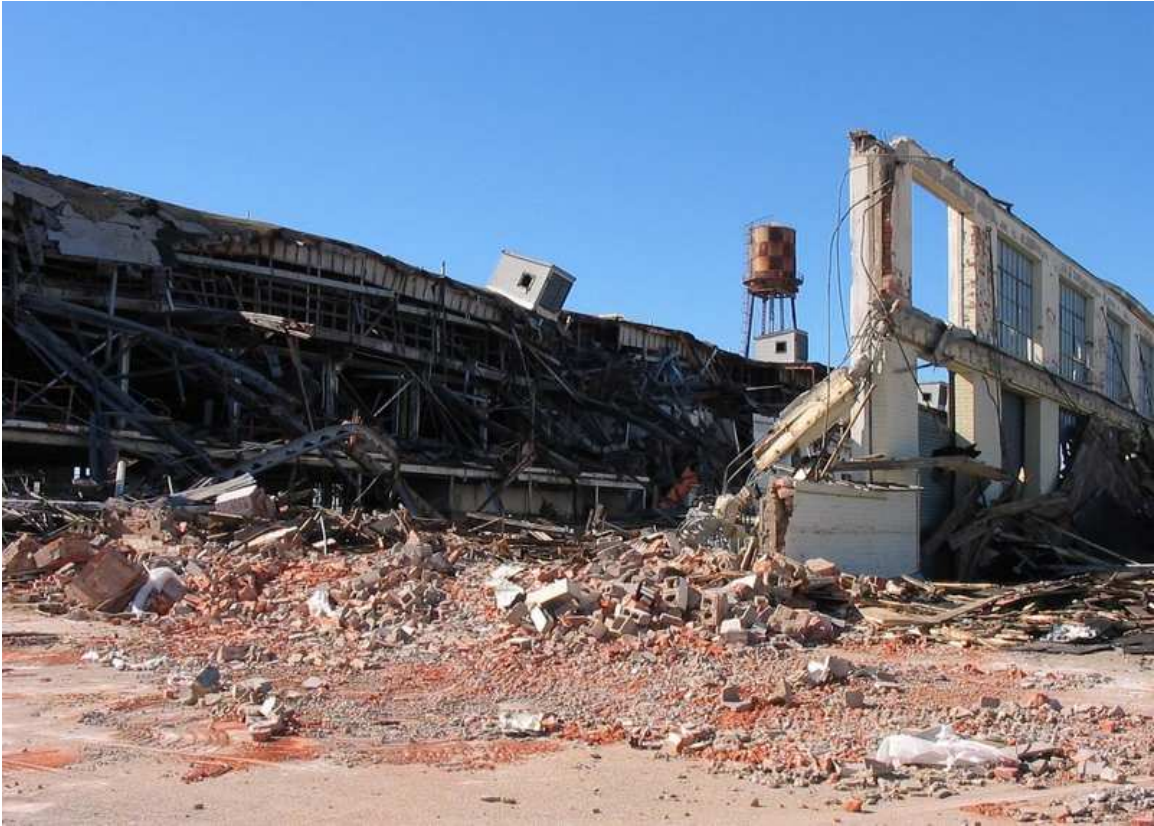
Demolition in progress. 2006